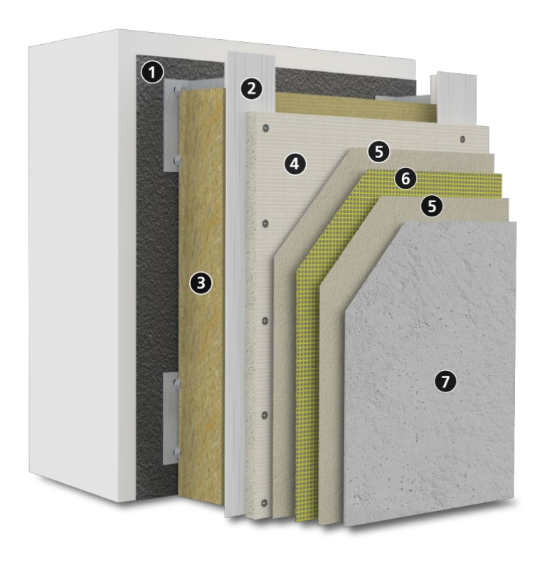
Figure 1 – StoVentec Render System