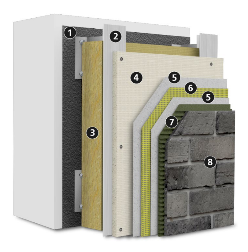
Figure 2 – StoVentec Masonry Veneer System